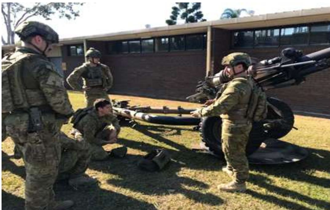
‘A’ Battery training