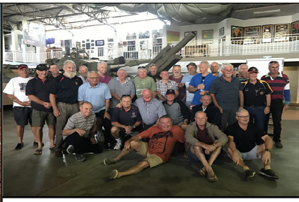
Members of “A” Fd Bty Vietnam (add 46 years) around the M2A2 – “The King of the Battle Field”