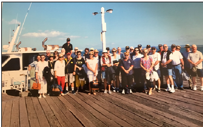
Boat Trip to Seal Rock – “A” Fd Bty Reunion March 2017