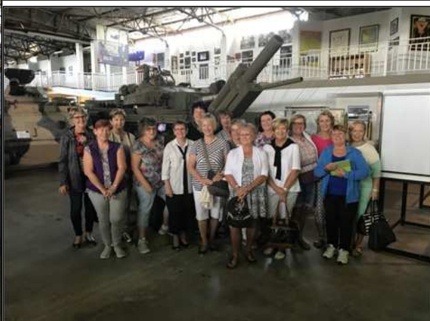
The Ladies who keep us on the straight and narrow!