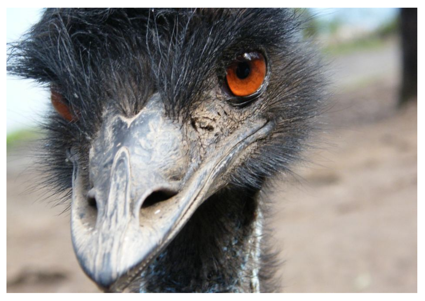
The emu: a native animal that is essentially a cross between an armoured car and a velociraptor.

The question of why, blessed as we are with a native animal that is essentially a cross between an armoured car and a velociraptor, our military has not taken advantage by training emus for combat duty in the ADF, remains unanswered to this day.