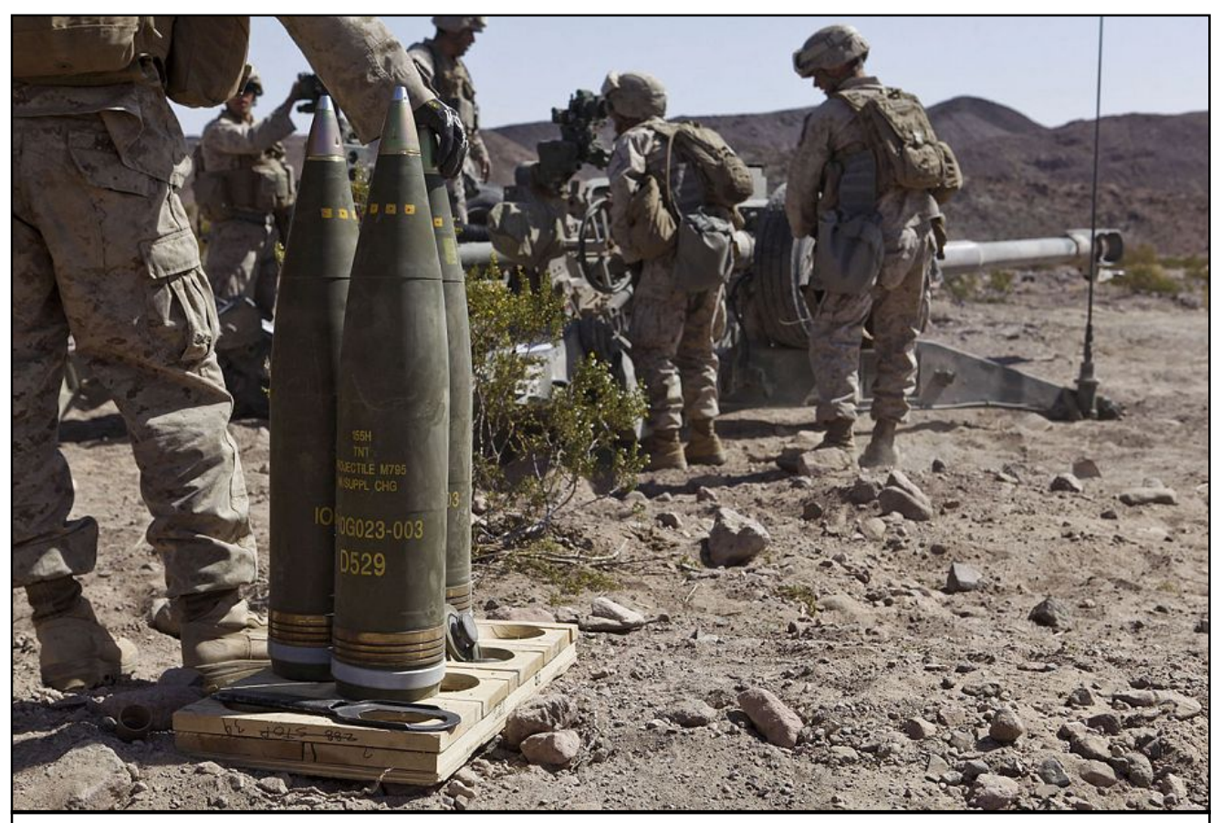
A U.S. Marine with Battery I, 3rd Battalion, 12th Marine Regiment stands ready to load an M795 High Explosive round into an M777 Lightweight 155mm Howitzer during the 11th Marine Regiment's Desert Fire Exercise aboard Marine Corps Air-Ground Combat Center 29 Palms, Calif. April 23, 2013.

The U.S. State Department has made a determination approving a possible Foreign Military Sale to Australia of M795 with Insensitive Munitions Explosive (IMX) 101 Explosive Fill 155mm HE projectiles for an estimated cost of $148 million.