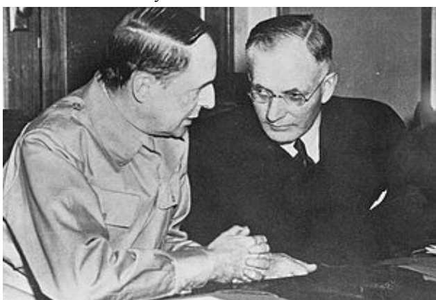
P M John Curtin confers with MacArthur

The raid was staged against the jungle base of the 7th Independent Platoon, Malayan Races Liberation Army in Central Johore and was carried out by Lincolns of No. 1 Squadron RAAF and Canberras of No. 12 Squadron RAF. It wiped out the camp and was regarded as the most successful of the 4,000 sorties flown by the Australians in Malaya.