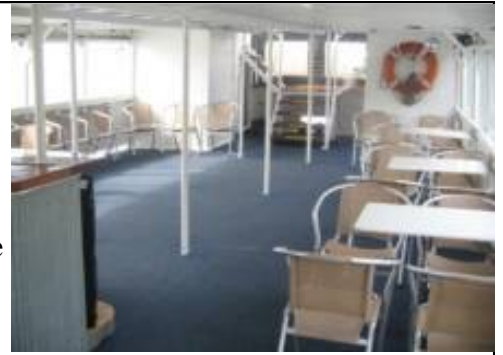
The Lower Deck