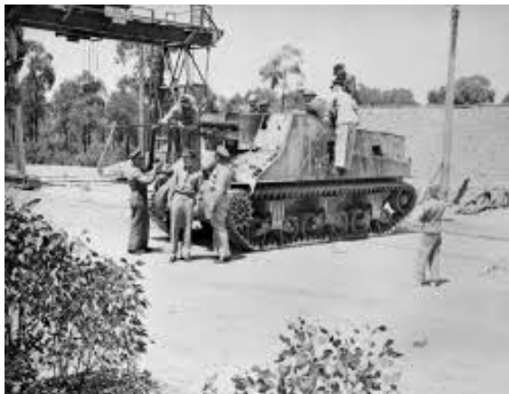
Officials inspecting the prototype SP 25-pounder Yeramba

A number of Yerambas have been known to survive, with the RAAC Tank Museum at Puckapunyal possessing a relatively complete example, but without the correct gun.