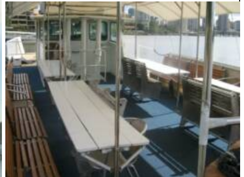
The Upper Deck