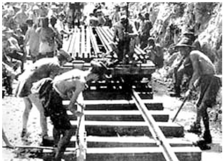
Prisoners of war laying railway track on the Burma-Thailand railway. c. 1943

After the end of World War II, 111 Japanese and