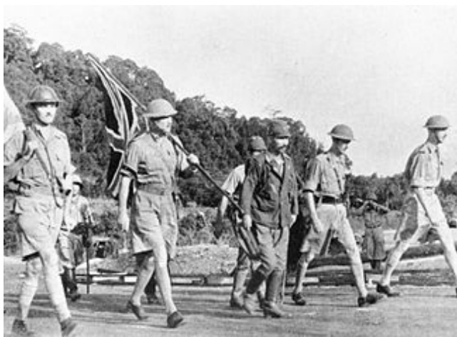
Lieutenant-General Arthur Percival, led by a Japanese officer, walks under a flag of truce to negotiate the capitulation of Allied forces in Singapore, on 15 February 1942