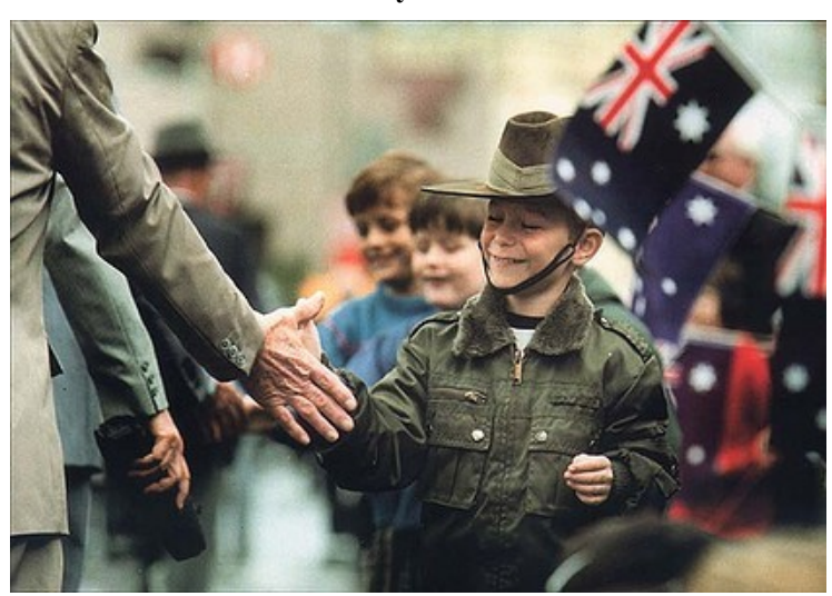
Passing generations, a boy reaches out to Diggers during the Anzac Day march on George Street Sydney 2014