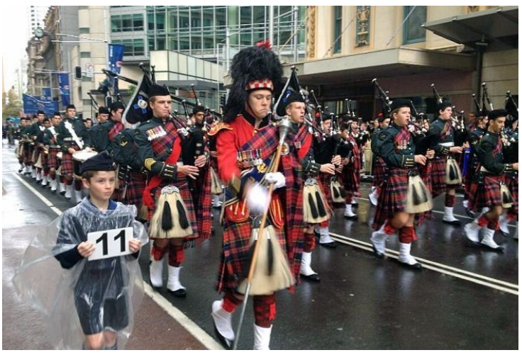
The band marches on despite wet weather for Sydney's Anzac Day march.