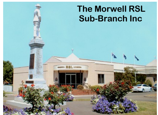
The Morwell RSL Sub-Branch Inc