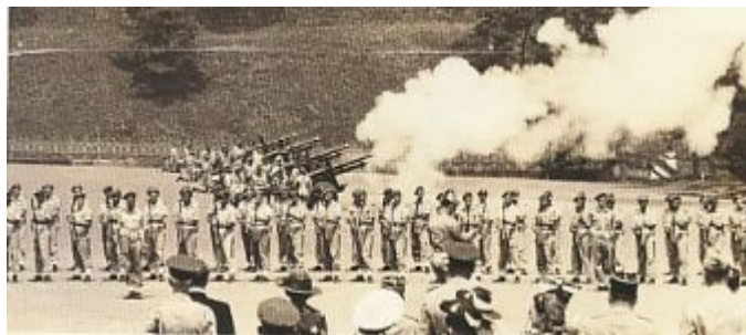
King George 6 th Birthday Parade-21 gun Salute-Japan-1947