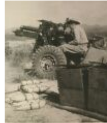
On a shoot in Japan.